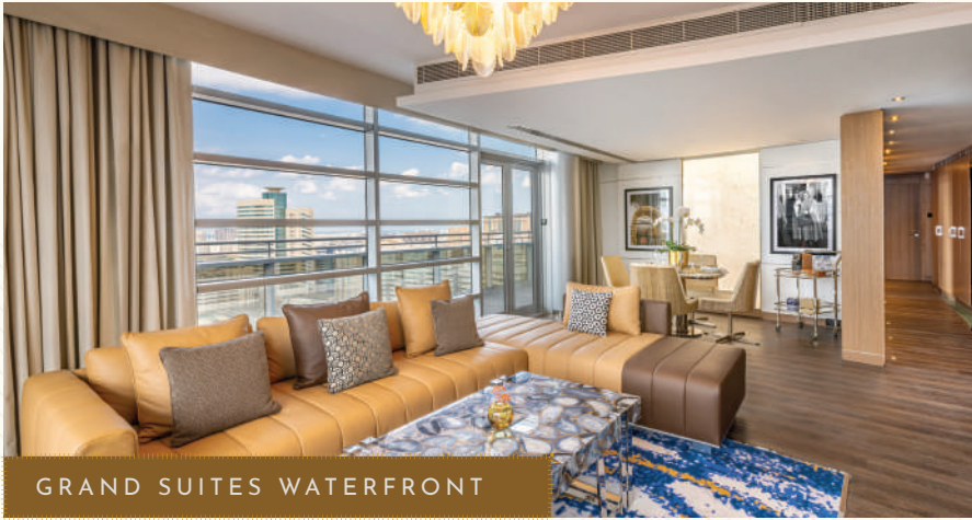
GRAND SUITES WATERFRONT